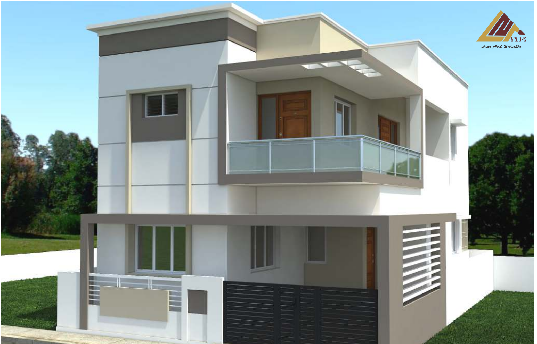
3 BHK Villa Elevation