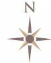
2 BHK Villa Plan

Total land area 1290 Sqft Total buildup area 1735 Sqft